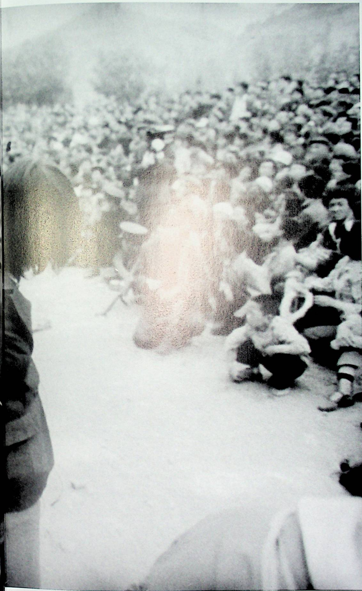
Public sentencing, c. 1980s.