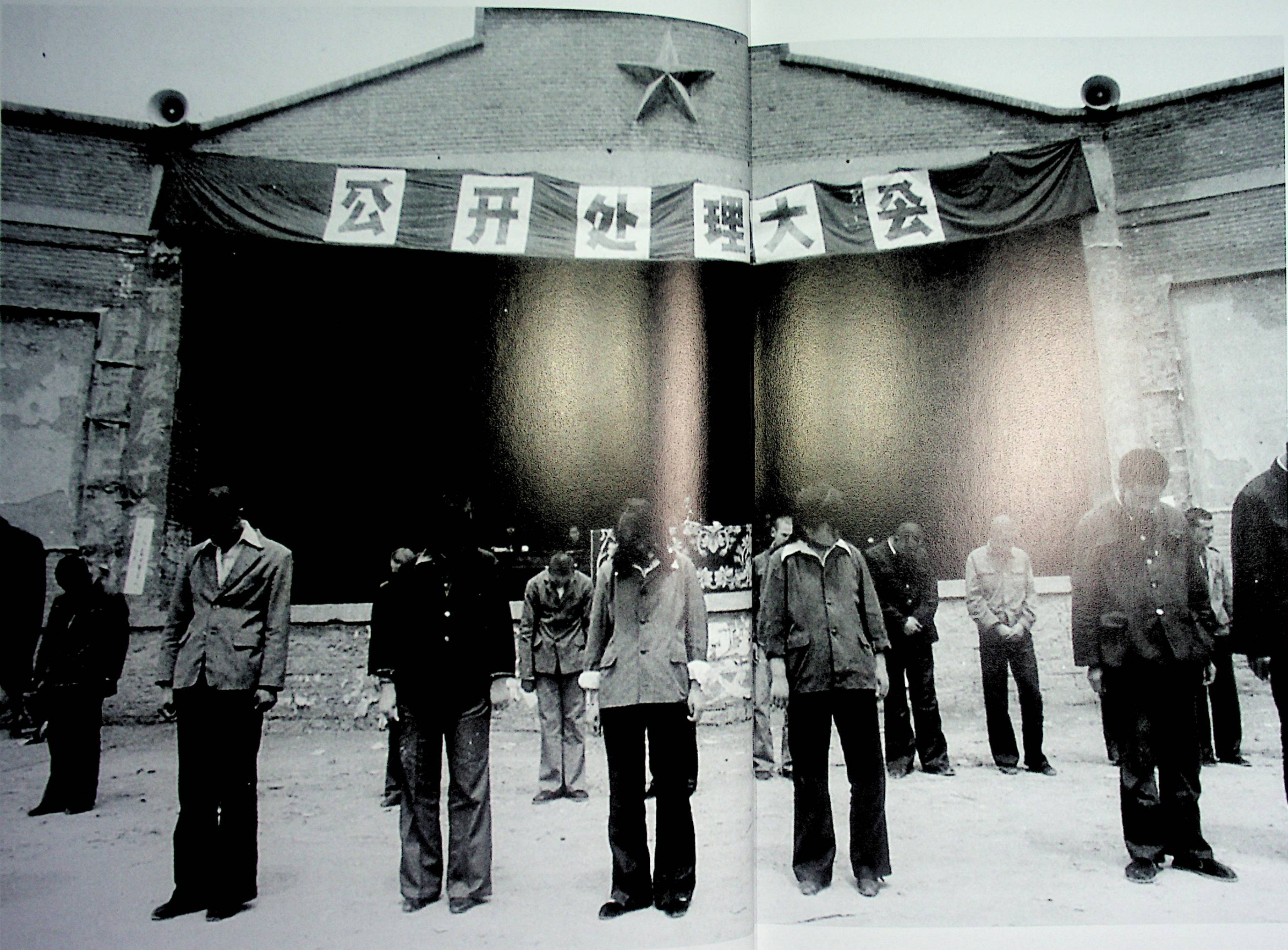
Public sentencing, c. 1980s.