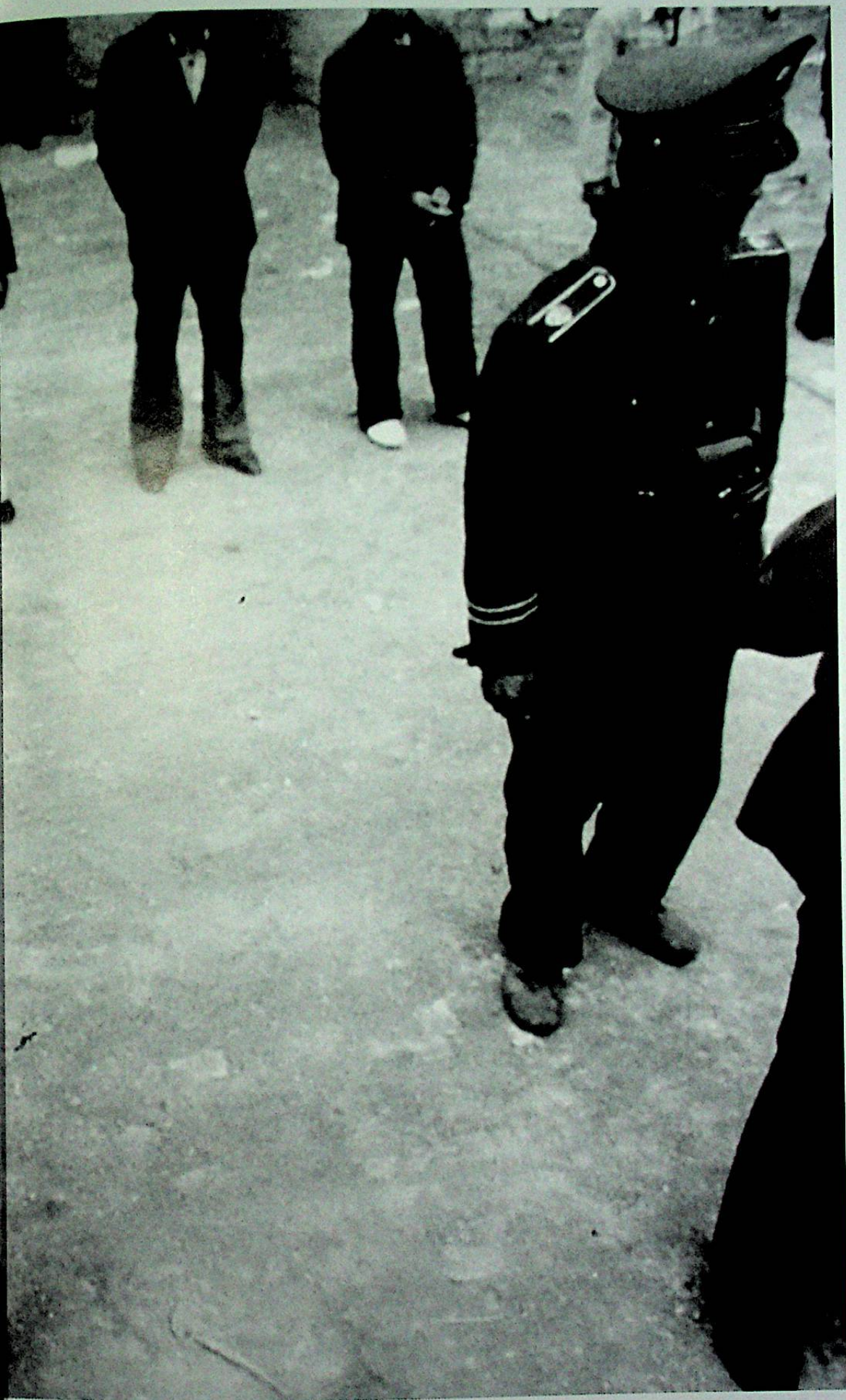
Public sentencing, c. 1980s.