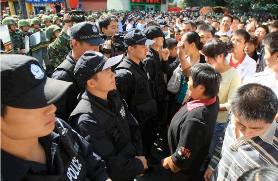
Han protestors approach police on September 3, 2009.

attacked Han Chinese with contaminated syringes. Most of the victims are elderly women...A local newspaper says about 400 people were attacked. I also heard that some Uyghurs attacked Han Chinese with sulfate.”