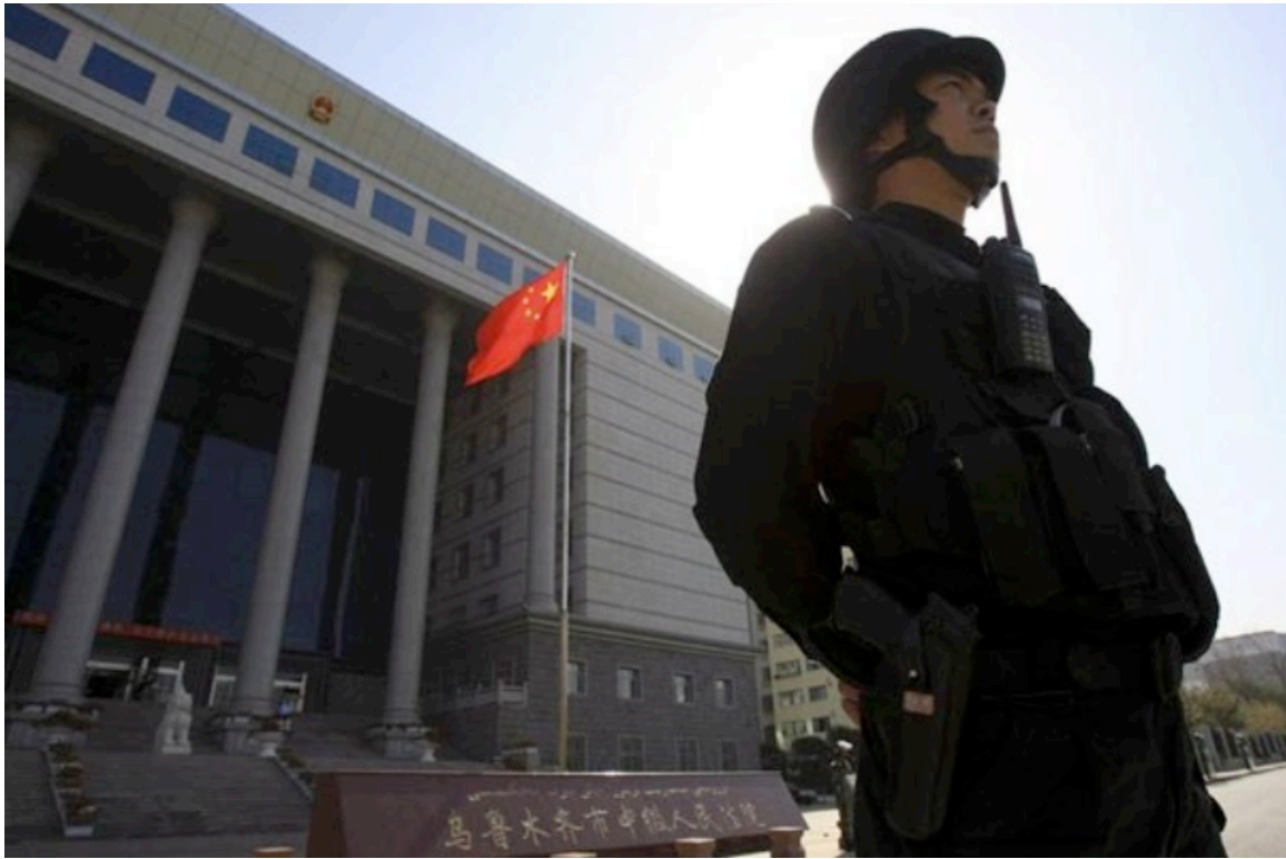
Police stands in front of Intermediate People's Court during pinprick attack trial, September 17, 2009.

There were also no reports from the official media of any arrests or detentions of Chinese individuals during the September unrest. Furthermore, details of charges against and trials of the “75 suspects...seven criminal rings and 36 cases” that occurred across East Turkestan described in the September 15, 2013 People's Daily report referred to earlier in this section are publicly unavailable. 116