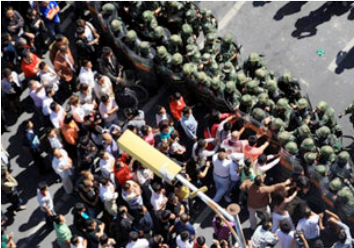
Han protestors clash with policeman on September 3, 2009.

A Uighur woman, Arwa Quli, complained: ‘There have been many Uighurs beaten up ... if you just brush against someone, they might think that you tried to stab them.’ 71