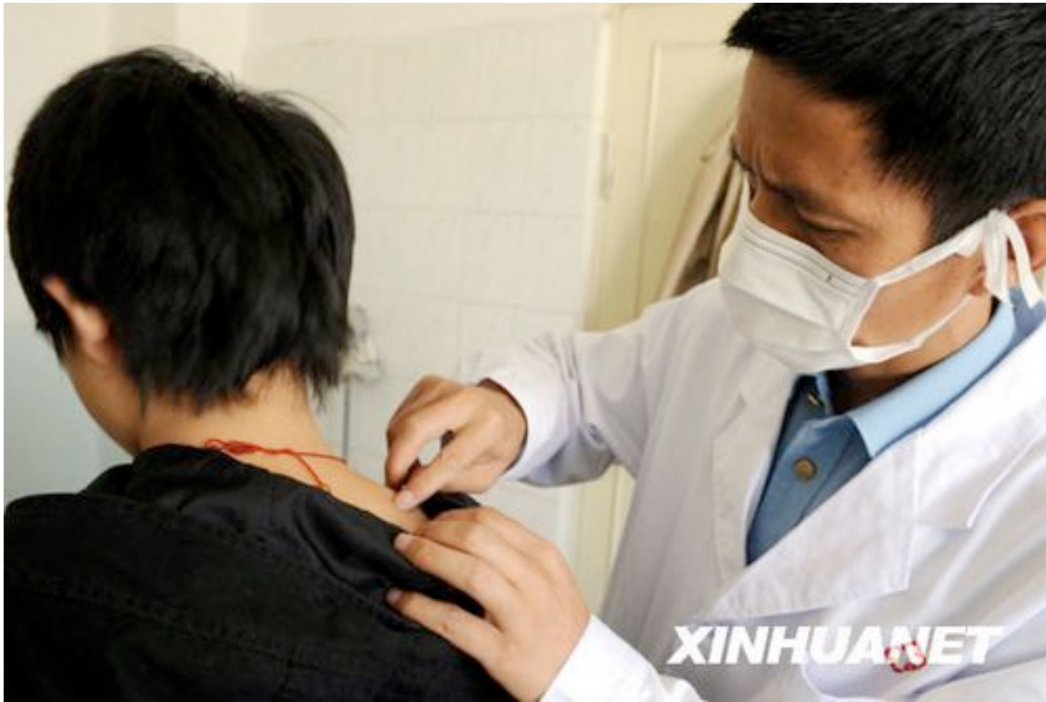
On September 9, 2009, China's state media ran this image of a doctor inspecting an alleged pinprick attack wound.

interview with Reuters, one Han resident responded positively to these alerts: “Now, we know that even if you are stabbed, it's not a big deal, so that's a relief.” 35