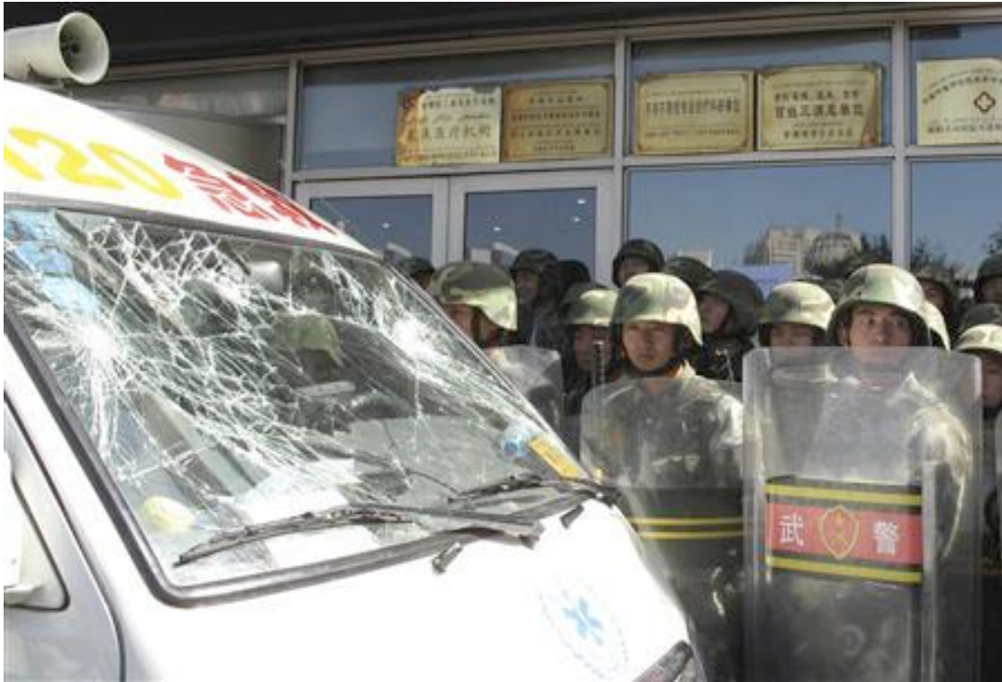
Police stand in front of damaged ambulance guarding Tianshan hospital where a Uyghur man was said to be receiving treatment after being beaten on September 3, 2009.

On Thursday, crowds severely beat a Uighur man they accused of syringe attacks, and then attacked the ambulance that had tried to extract him from the crowd. It is not known whether any of Thursday's casualties died in that incident. 86