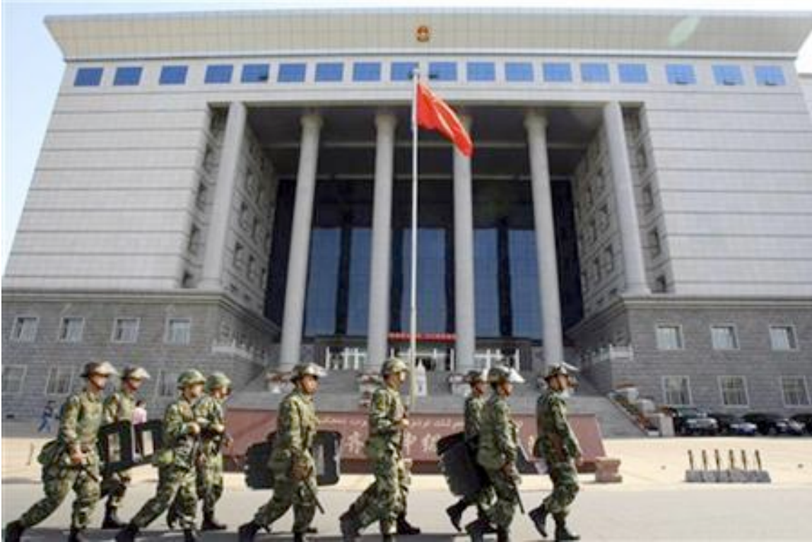
Policemen walk past the Intermediate People's Court in Urumqi, September 12, 2009.