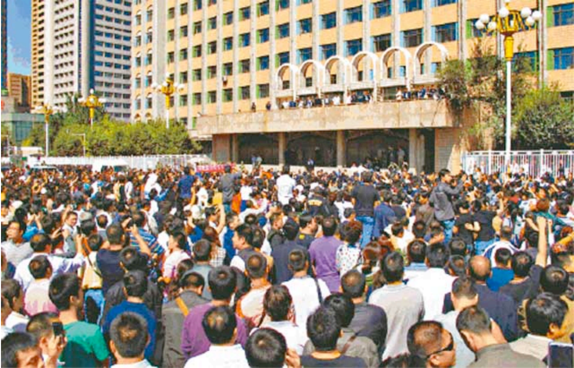
Above: Crowd gathers in People's Square before government leaders, on September 3, 2009.